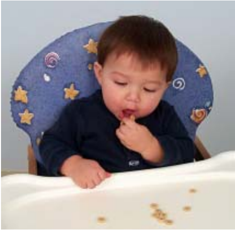
Baby picking up cheerios from tray.

Look at the baby in each picture. Think about what responses might expand the baby's idea. Look on the right to see some examples of parallel talk. These comments could expand the idea while sharing the baby's interest and attention.