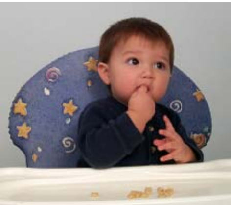
Putting one in mouth -- big smile.