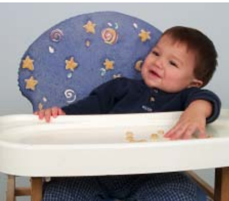
Reaching for more.