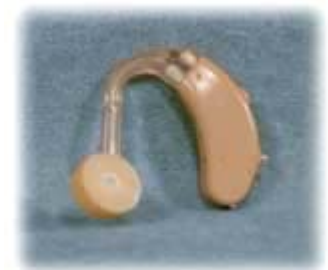
Snap Tip™ Earmold

Remote Microphone - In special cases where feedback is very difficult to control, a remote microphone can be used if the hearing aid has a Direct Audio Input (DAI) option. Feedback can be reduced this way because the distance between the hearing aid microphone and hearing aid receiver (speaker) can be increased. The microphone can be clipped to the child's hair or attached to a hat or bonnet.